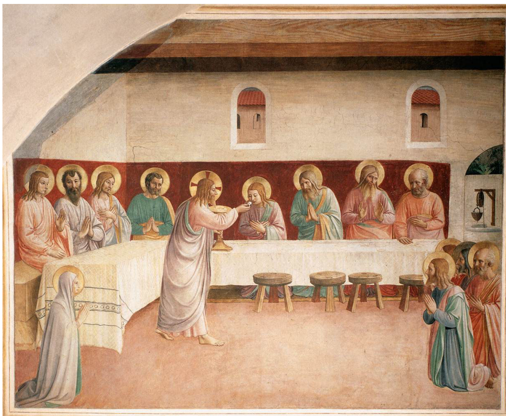
Institution of the Eucharist, by Fra Angelico, 1441-42

We, the community of St. Francis de Sales Parish, seek to LIVE JESUS through the empowerment of the Holy Spirit by ministering to the needs of our brothers and sisters through Word, Worship, Education and Service.