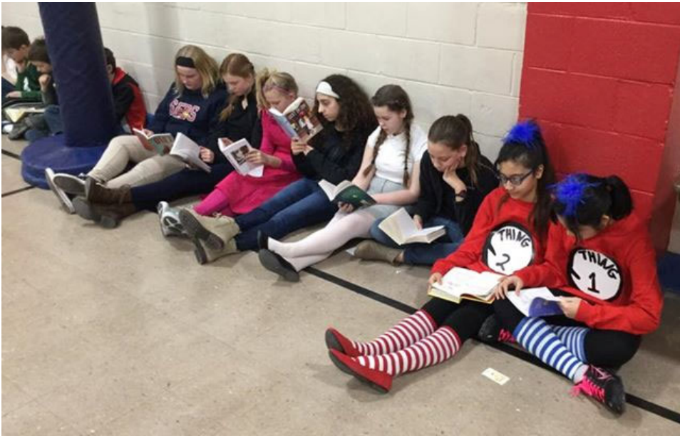
Stop and Read