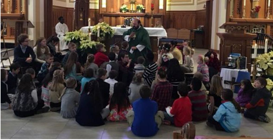
All School Mass

Thank you to all the families who helped to support Catholic Schools Week at Saint Francis de Sales School. As you can see from the pictures below, the students had a great week filled with spiritual, academic, and fun experiences throughout the week.