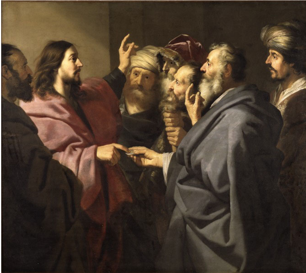
The Tribute of Money by Jacob Adriaensz Backer, 1633

We, the community of St. Francis de Sales Parish, seek to LIVE JESUS through the empowerment of the Holy Spirit by ministering to the needs of our brothers and sisters through Word, Worship, Education and Service.