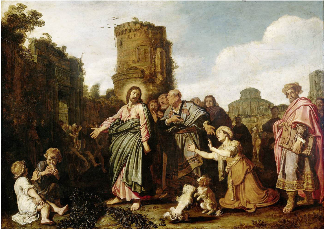
Christ and the Canaanite Woman by Pieter Pietersz Lastman, 1617

We, the community of St. Francis de Sales Parish, seek to LIVE JESUS through the empowerment of the Holy Spirit by ministering to the needs of our brothers and sisters through Word, Worship, Education and Service.