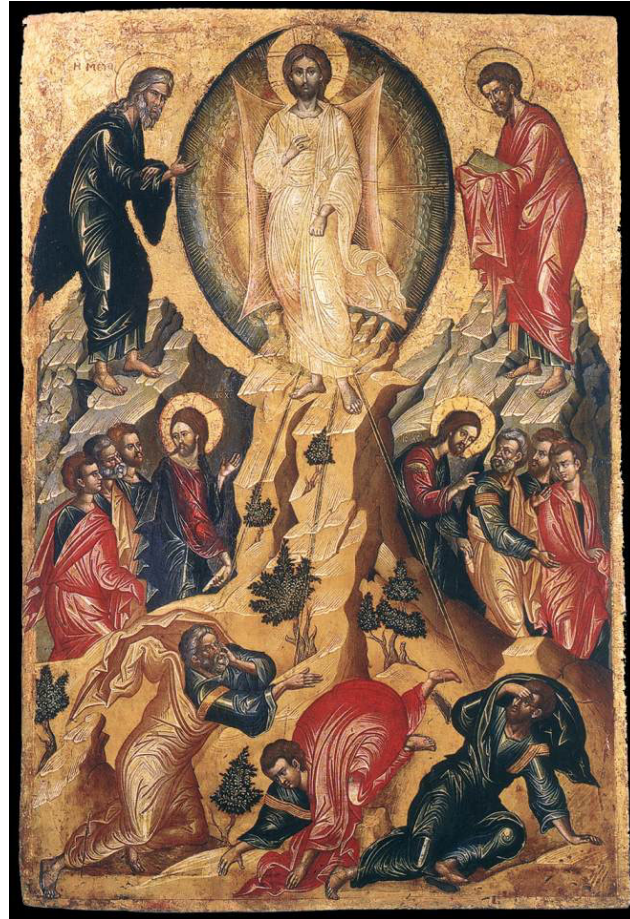
Transfiguration of Christ, Unknown Artist. 1550

We, the community of St. Francis de Sales Parish, seek to LIVE JESUS through the empowerment of the Holy Spirit by ministering to the needs of our brothers and sisters through Word, Worship, Education and Service.