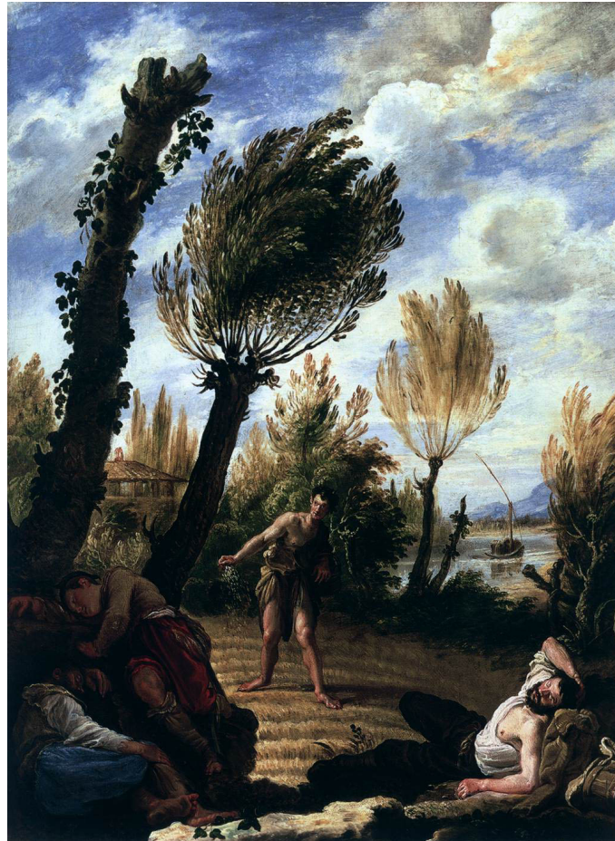
Parable of the Sower by Domenico Fetti, 1619

We, the community of St. Francis de Sales Parish, seek to LIVE JESUS through the empowerment of the Holy Spirit by ministering to the needs of our brothers and sisters through Word, Worship, Education and Service.