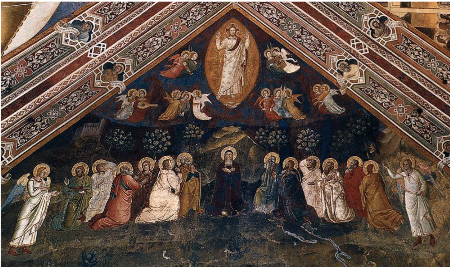
Ascension of Christ by Andrea da Firenze, 1366-67

We, the community of St. Francis de Sales Parish, seek to LIVE JESUS through the empowerment of the Holy Spirit by ministering to the needs of our brothers and sisters through Word, Worship, Education and Service.