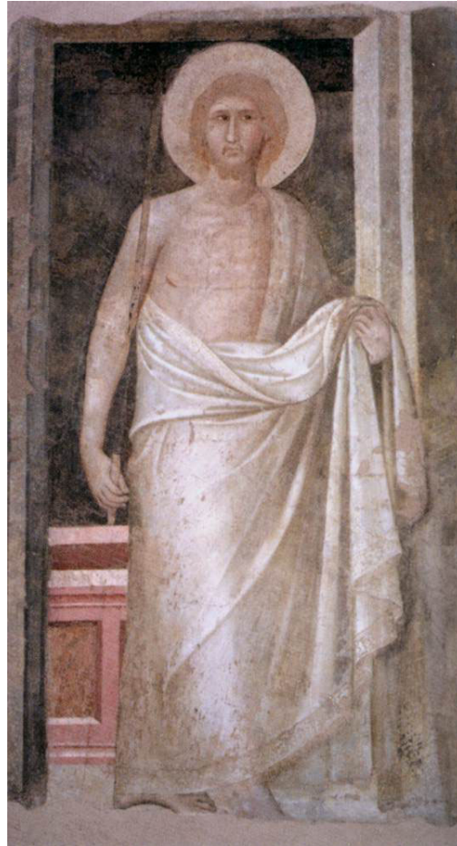
The Resurrected Christ, Pietro Lorenzetti,

We, the community of St. Francis de Sales Parish, seek to LIVE JESUS through the empowerment of the Holy Spirit by ministering to the needs of our brothers and sisters through Word, Worship, Education and Service.