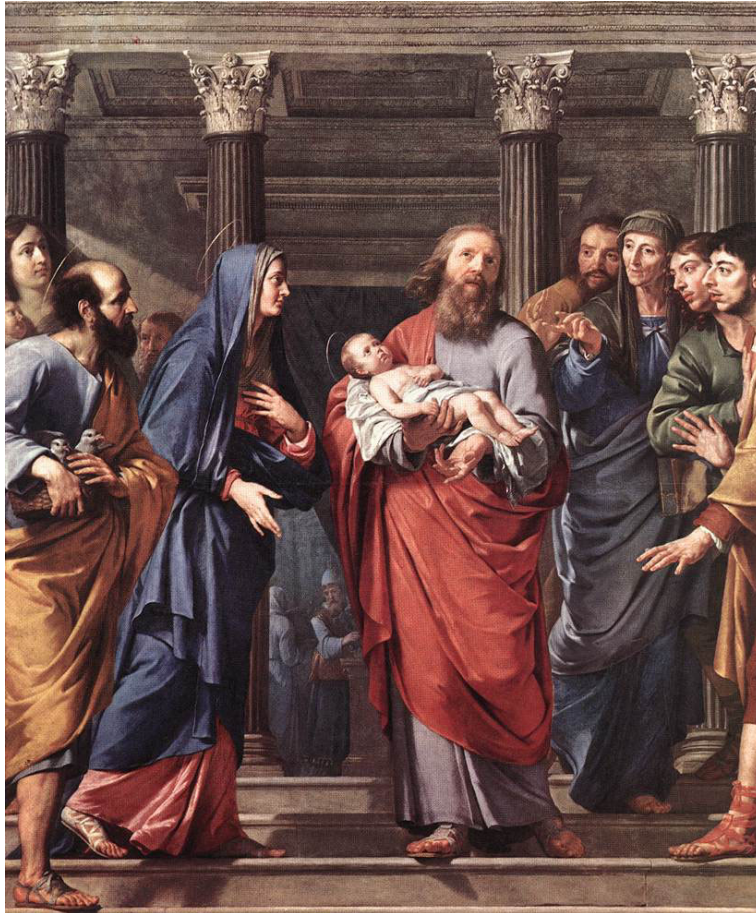
Philippe de Champaigne, The Presentation of the Temple, 1648

We, the community of St. Francis de Sales Parish, seek to LIVE JESUS through the empowerment of the Holy Spirit by ministering to the needs of our brothers and sisters through Word, Worship, Education and Service.