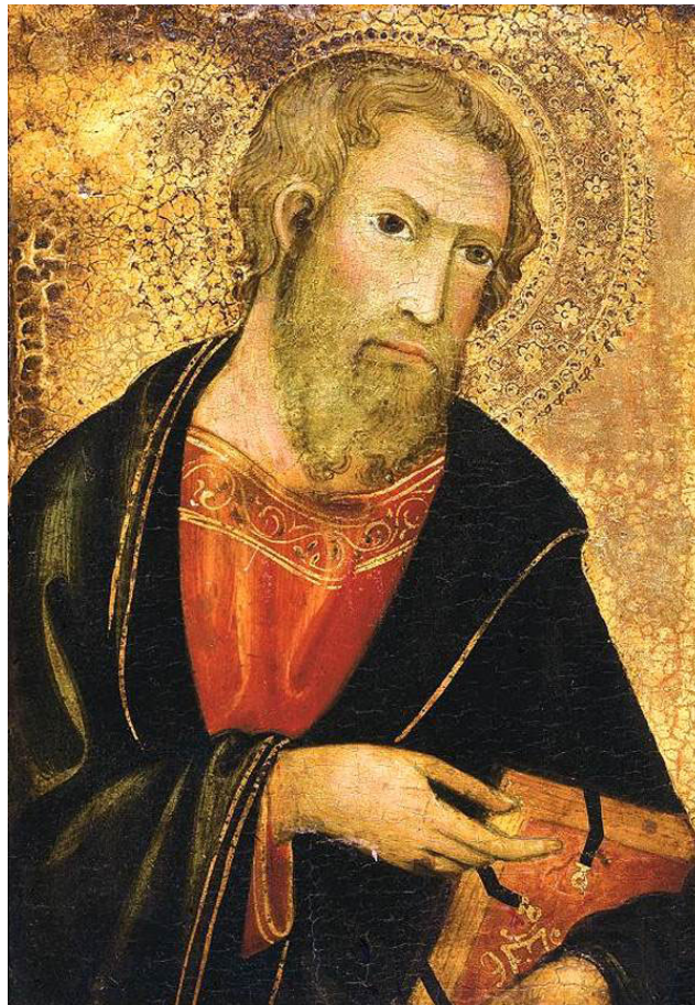
Andrea di Bartolo, St. Paul

We, the community of St. Francis de Sales Parish, seek to LIVE JESUS through the empowerment of the Holy Spirit by ministering to the needs of our brothers and sisters through Word, Worship, Education and Service.