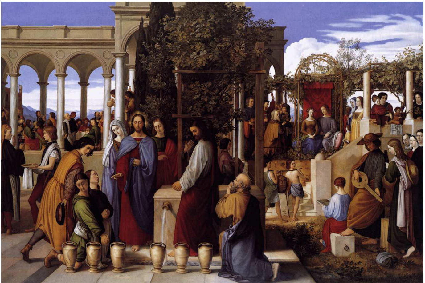
Julius Schnorr von Carolsfeld, The Wedding Feast at Cana, 1819

We, the community of St. Francis de Sales Parish, seek to LIVE JESUS through the empowerment of the Holy Spirit by ministering to the needs of our brothers and sisters through Word, Worship, Education and Service.