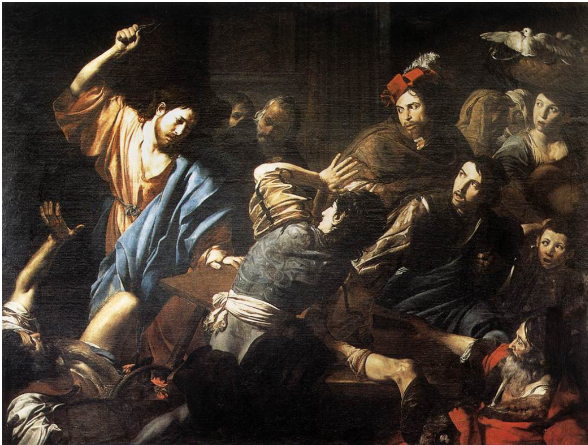
Christ Driving the Money Changers out of the Temple, by Valentin de Boulogne, c. 1618

We, the community of St. Francis de Sales Parish, seek to LIVE JESUS through the empowerment of the Holy Spirit by ministering to the needs of our brothers and sisters through Word, Worship, Education and Service.